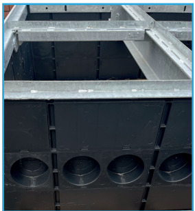
Cover and frames are compatible with our Nexus range of chambers