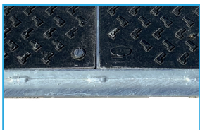
Closed keyways preventing dirt and debris entering the chamber