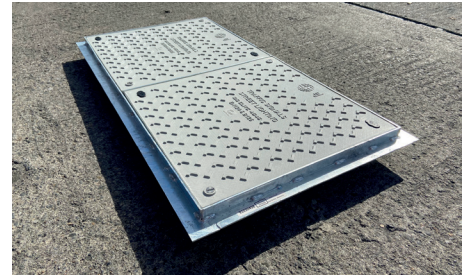
Cover available in any RAL colour to blend in with paving or pavement surrounding