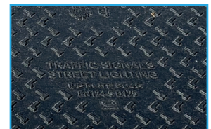
Third party certification to EN 124-5:2015 by the NSAI