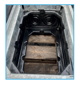
Cover and frames are compatible with our DATUM range of chambers