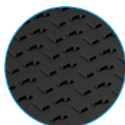
4L® Design Anti Slip Top Plate