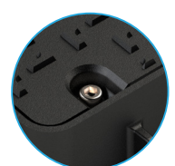
Cover Locking Point