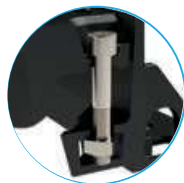
Locked CHC & Cage Nut