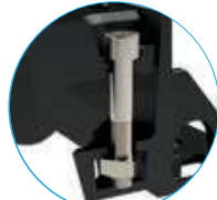
Locked CHC & Cage Nut